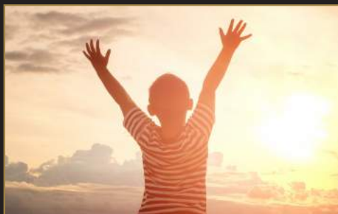
6/2, 9, 16, 23, 30