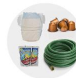
Put in Garbage