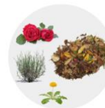
Put in Organics Bin