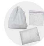
Recycle With Plastic Bags