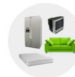
Large Item Pickup