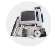
Recycle With E-Waste